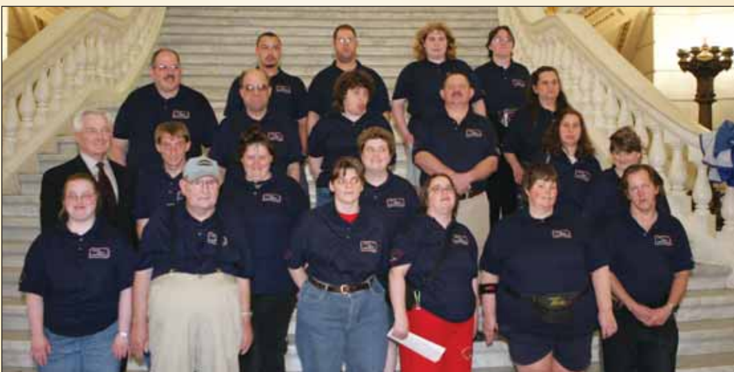
Senator Bob Robbins visited with participants of Crawford County LEAP as they toured Pennsylvania's State Capitol in May. Crawford County LEAP assists individuals with cognitive and/or mental health challenges.